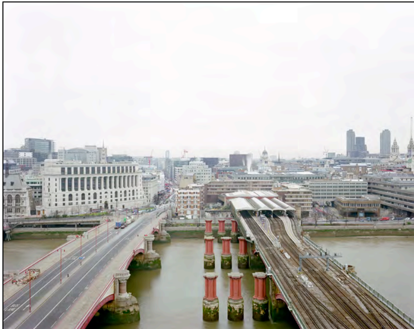
"From Blackfriars North 2008" (Digital C type print, 122 x 152.5cm).

London Cityscapes , Janet Borden, Inc. 560 Broadway #501, New York, NY September 10 through October 17