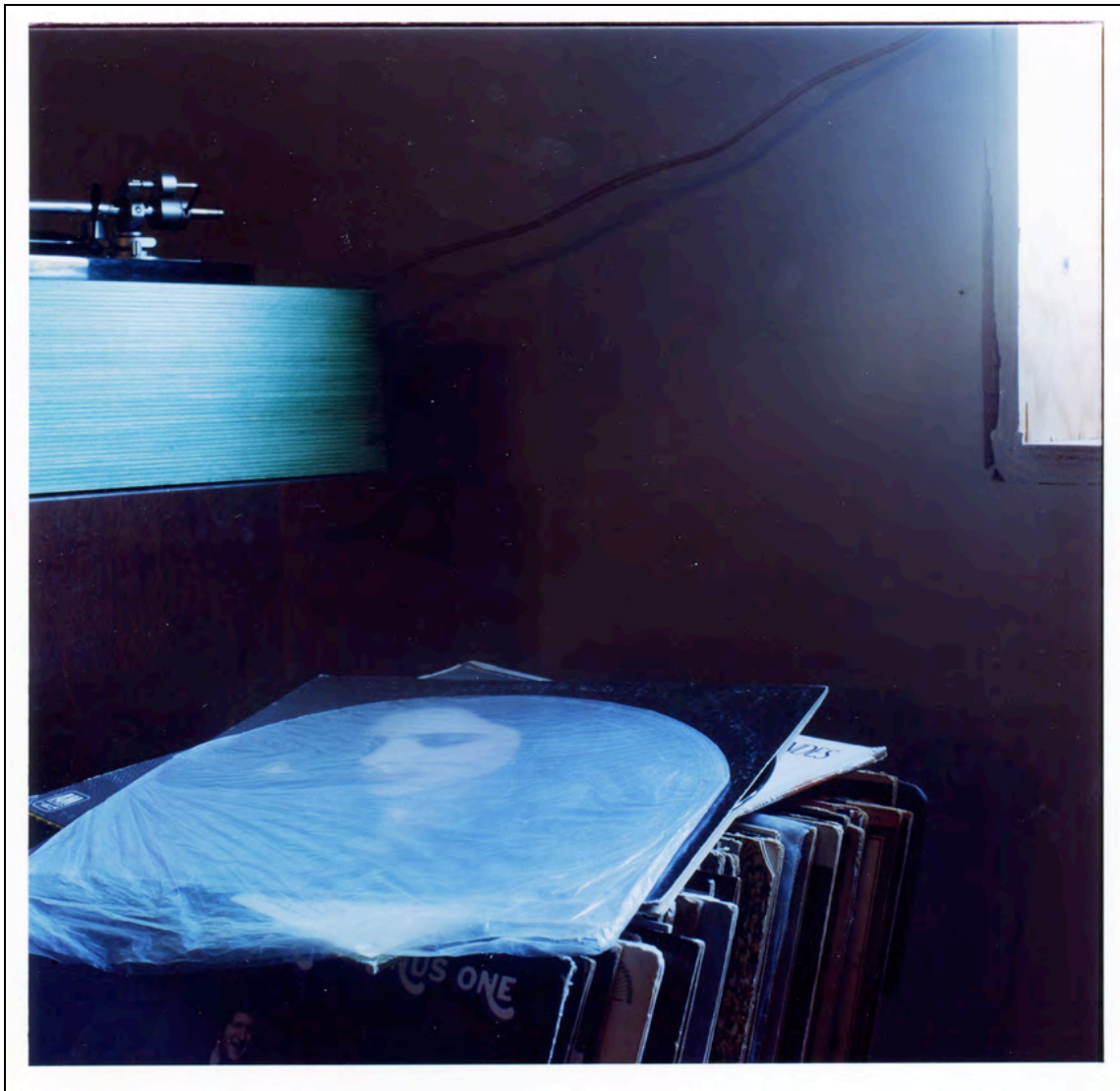
"Nyro" 2003. C-Print, 24 x 20 inches

Thursday, November 5 Moyra Davey, SMFA Viz/Crit Room B311, 12:30 - 2:00